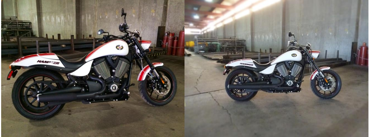
V-925 – Victory BAD BOY – 2005-UP HAMMER/JACKPOT V-926 – Victory BIG DADDY – 2005-UP HAMMER/JACKPOT

Thank you for purchasing this RPW USA product. We believe that our products are the very best available and are engineered to provide a lifetime of use. These pipes can be installed on Victory Hammer/Jackpot models from 2006 to present. Basic hand tools and a service manual applicable to your model of motorcycle are all that is necessary to complete the installation.