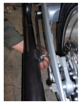
Page 3 of 3