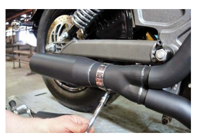
Align bracket with muffler. Slide in muffler bracket insert into back of muffler and attach muffler to mounting bracket using 5/16" x ^3\!\!/_{\!\!4} cap screws with flat and lock washers, tighten bracket to muffler and then tighten your muffler T-bolt clamp onto header pipe making sure edges are aligned with front end of muffler edge.