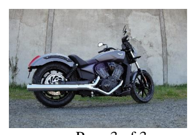
Page 3 of 3

<u>Please Note:</u> Pipes are not warranted against discoloration and <u>UNDER NO CIRCUMSTANCE</u> will pipes be warranted after they have been run on an engine.