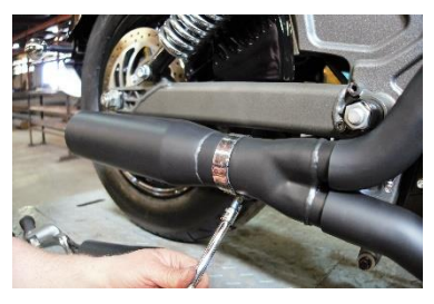
Align bracket with muffler. Slide in muffler bracket insert into back of muffler and attach muffler to mounting bracket using 5/16" x 3/4 cap screws with flat and lock washers, tighten bracket to muffler and then tighten your muffler T-bolt clamp onto header pipe making sure edges are aligned with front end of muffler edge.