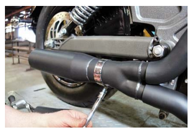
Align bracket with muffler. Slide in muffler bracket insert into back of muffler and attach muffler to mounting bracket using 5/16" x ^3 4 cap screws with flat and lock washers, tighten bracket to muffler and then tighten your muffler T-bolt clamp onto header pipe making sure edges are aligned with front end of muffler edge.